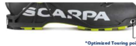
*Optimized Touring point

In order to maximize all efficiencies when moving uphill, some models with TLT fittings have moved the tech toe fittings further under the foot. This effectively makes for a more natural stride that offers significant energy savings - especially important on big days!